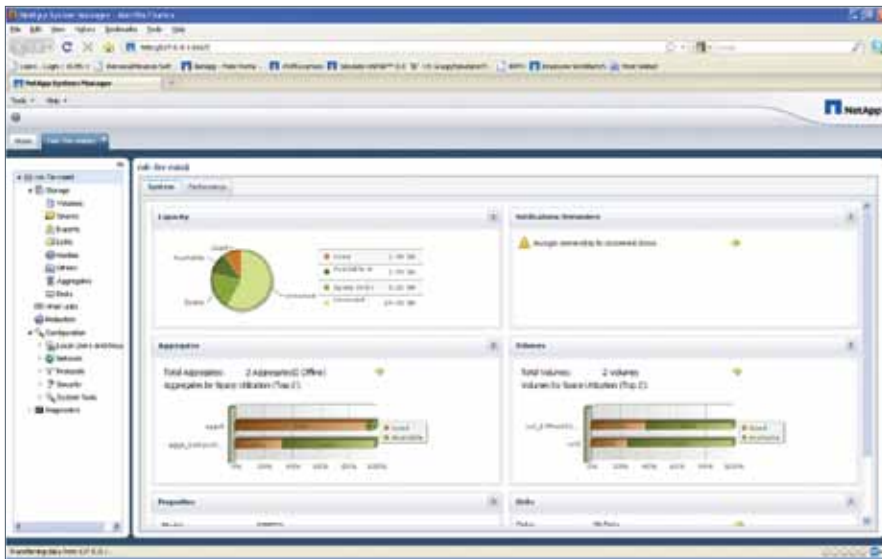
Figure 1) You don't need to be an expert to configure your storage with the simple, easy-to-use NetApp System Manager Console.