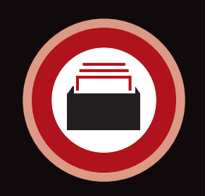
Veritas <sup>™</sup> Data Insight